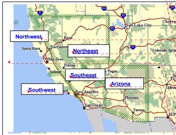
Figure 1.0 Far Western District

Chapters have been, or new chapters will be, assigned to the geographical division that is identified with their normal meeting place as shown below.