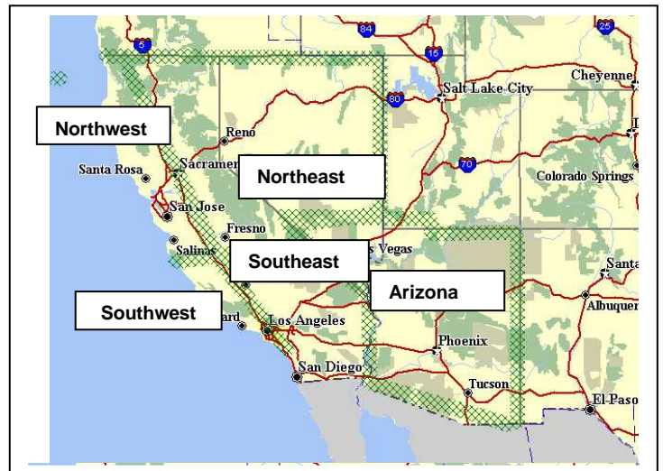
Figure 1.0 Far Western District

Chapters have been, or new chapters will be, assigned to the geographical division that is identified with their normal meeting place as shown below.